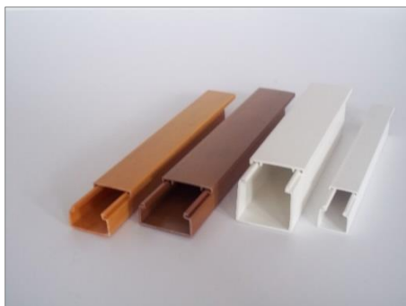
Fig.2 CTS trunking - light wood, dark wood, white