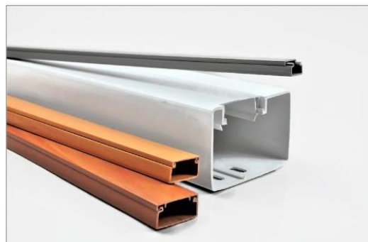
Fig.3 CTS trunking - light wood, dark wood, white, grey