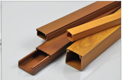
Fig.7 CTS trunking - light wood and dark wood