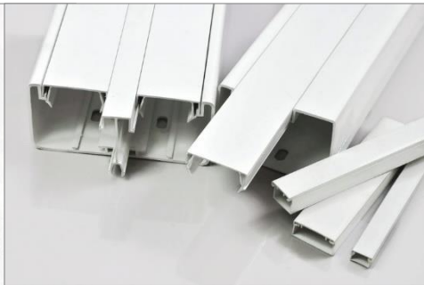
Fig.6 CTS trunking - white