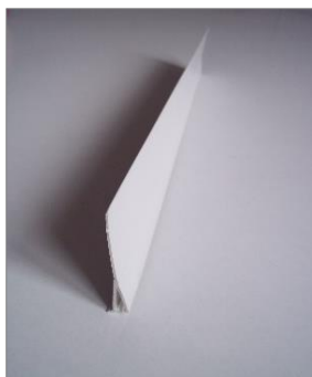
Fig.1 Partition for CTS trunking