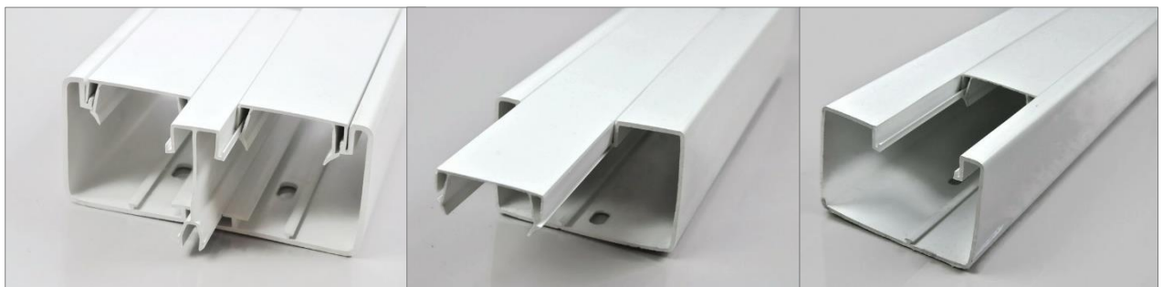
Fig.8,9,10 DS-45 trunking - white

The above information is based on the current state of knowledge and applies to the product as manufactured by the manufacturer: Elektroplast Spółka z ograniczoną odpowiedzialnością.